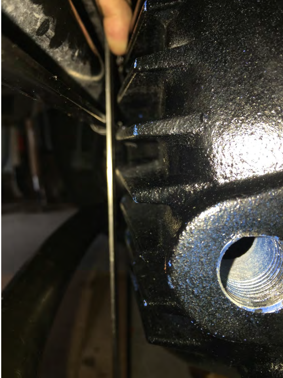
Final clearance between panhard bar and modified PML cover was .25"