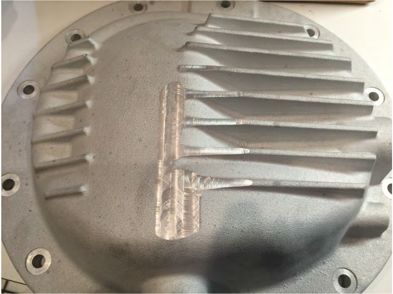
Removed another .125" from cover.