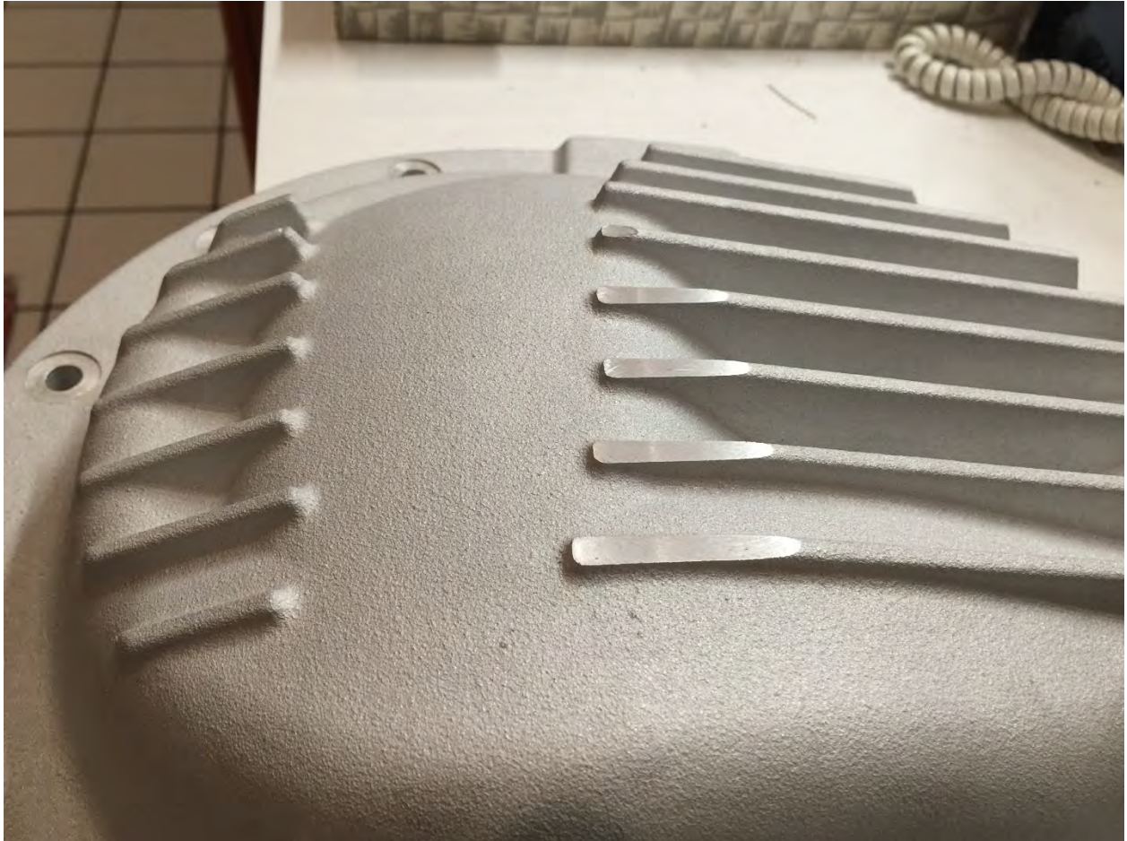
Installation notes. Diff cover as originally modified by PML