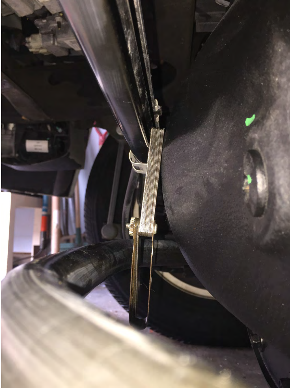
.40" clearance between pan hard bar and factory diff cover.